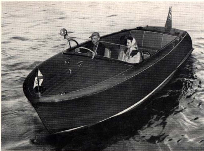
NEW SHEPHERD 22-FOOT UTILITY, SPEEDS UP TO 40 M.P.H.