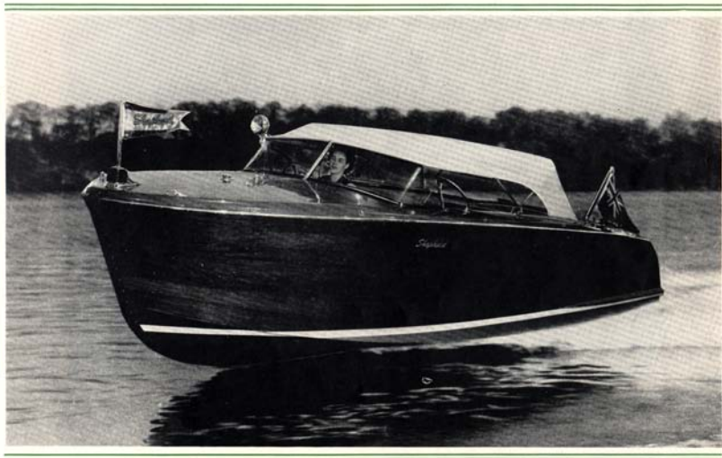
NEW SHEPHERD 22-FOOT SPORTSMAN, SPEEDS UP TO 40 M.P.H.