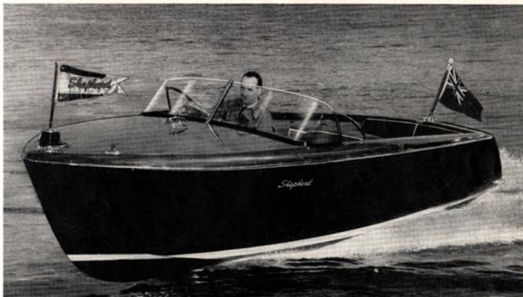
NEW SHEPHERD 18-FOOT UTILITY, SPEEDS UP TO 40 M.P.H.