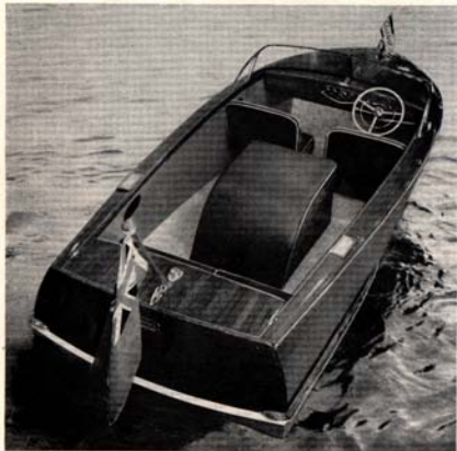
NEW SHEPHERD UTILITY SPEEDS UP TO 40 M.P.H.