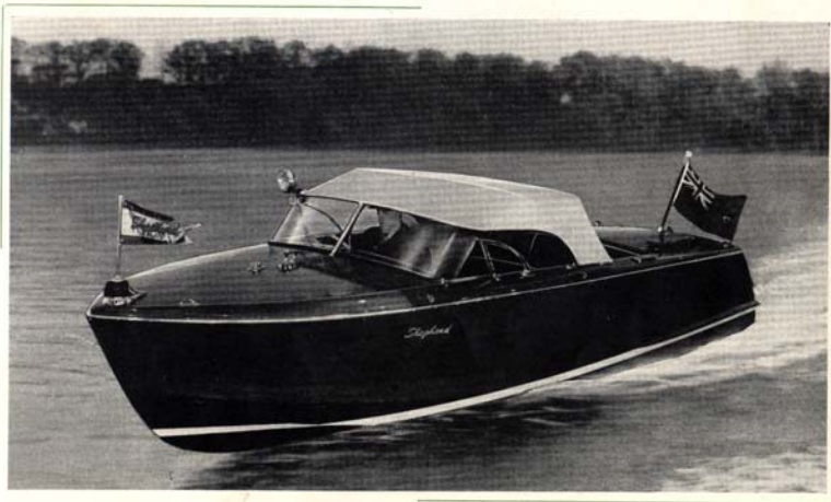
NEW SHEPHERD 18-FOOT CONVERTIBLE, SPEEDS UP TO 44 M.P.H.