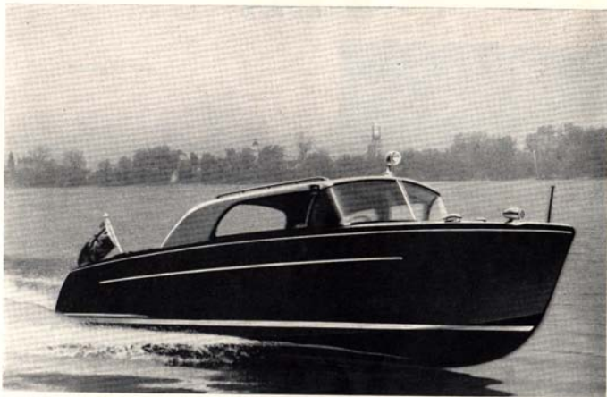
NEW SHEPHERD 22-FOOT CUSTOM SEDAN, SPEEDS UP TO 40 M.P.H.