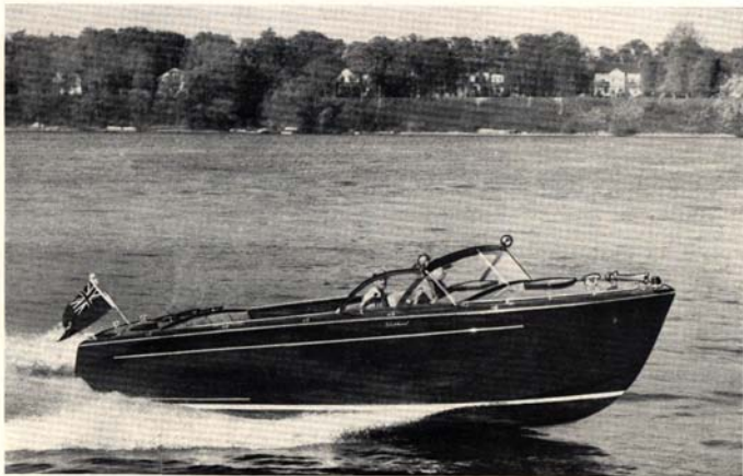
NEW SHEPHERD CUSTOM COMMUTER SPEEDS UP TO 38 M.P.H.